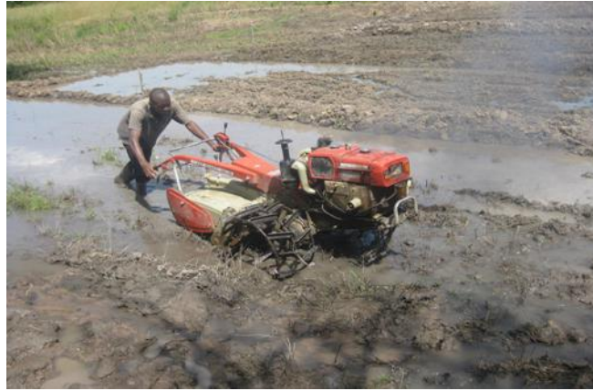
Figure 2. Demonstration of the use of the power tiller on a farmer's field.

use efficiency is greatly improved and the high yielding varieties would be able to demonstrate their inherent potential yields between 4 to 6 t/ha.