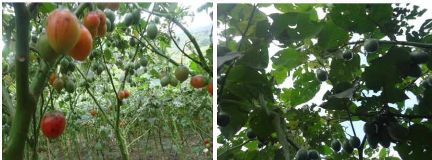
Figure 2. Smallholder farmer plots where samples have been collected

Each sample was crushed and the plant extract (juice) was recovered in eppendorf. At the rate of 120 μL (100 μL of extraction buffer and 20 μL of sample), wells for potyvirus detection were loaded except for the substrate wells and the background wells. The negative controls (healthy plants) were collected in a greenhouse, while the positive controls (infected plants) were purchased from the Swiss company BIOREBA. Charged plates were incubated overnight in the fridge at 4°C. The following day, the plates were washed 3 times with washing buffer at a rate of 120 μL per well.