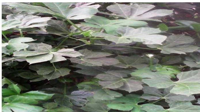
Figure 1. Chaya plant ( Cnidoscolus chayamansa )

Kaduna. Chaya leaves were harvested thoroughly washed with clean water and were chopped to approximately 2-3 cm sizes. The sample of the chopped leaves was divided into two parts; the first part was shade dried at room temperature for three days and label as raw dried sample (RDS).